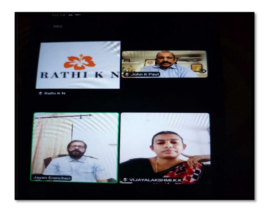
Highlights of the Programme