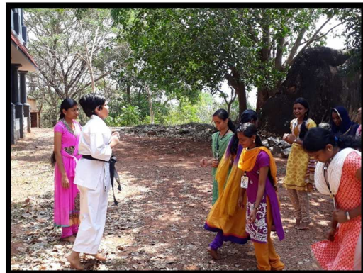
Highlights of the Programme