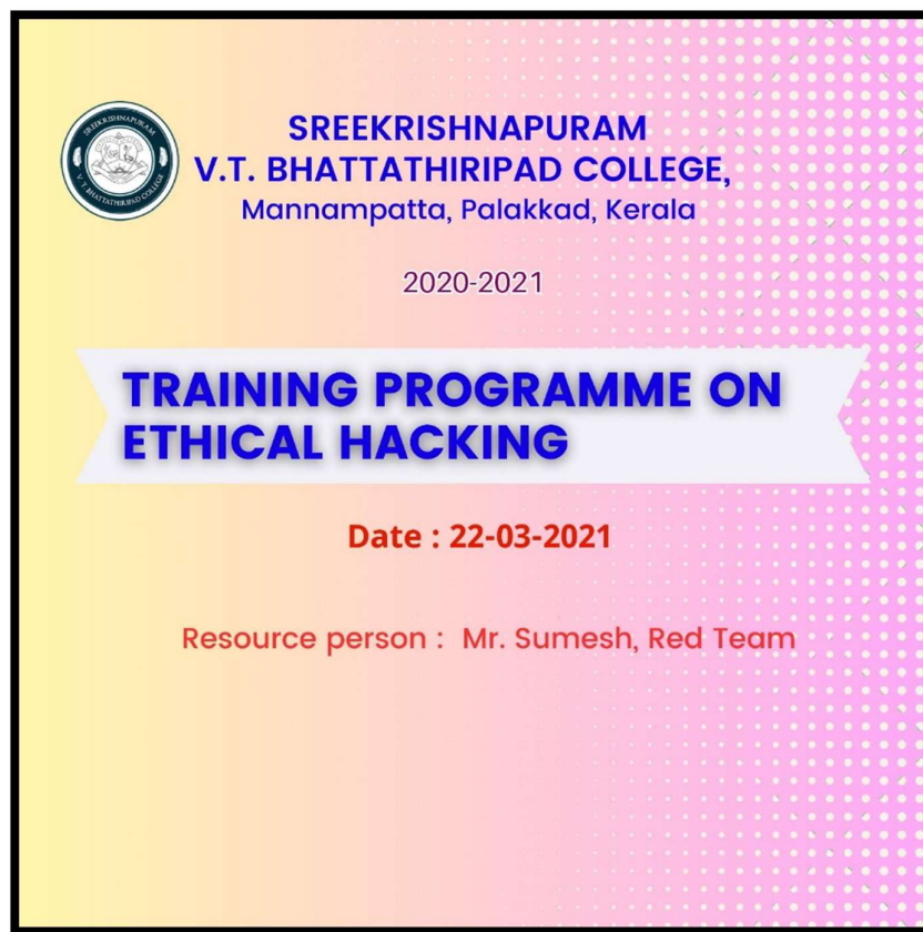
Brochure of the Workshop

The workshop included practical demonstrations and hands-on exercises, allowing students to apply theoretical concepts in real-world scenarios. Participants learned about different hacking tools and techniques used to identify and mitigate security threats. Mr. Sumesh also emphasized the importance of ethical practices in cybersecurity and how they contribute to the protection of digital assets.