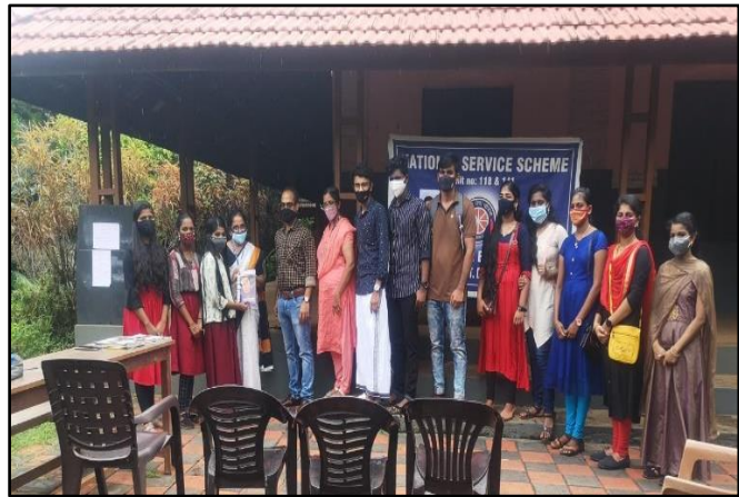
Labour India Distribution at Sreekrishnapuram HSS