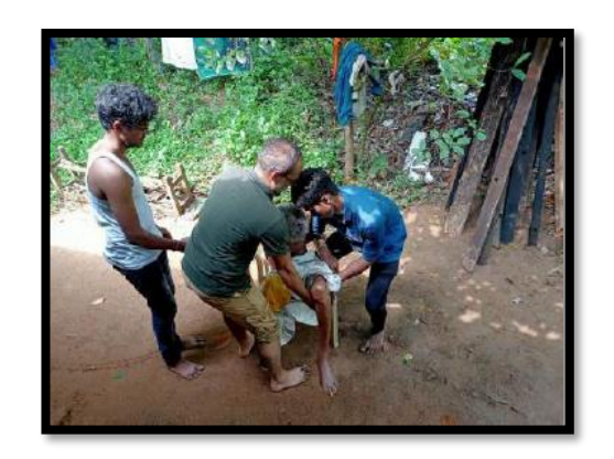
Ardram (2022-23) Palliative Regular visit