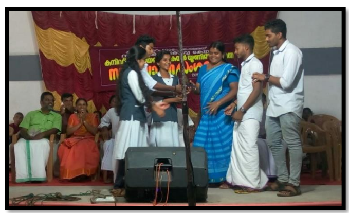
III. Donation of Items for Palliative care units of Sreekrishnapuram and Kadampazhipuram Panchayats

• F A box and cleaning materials for palliative care patients