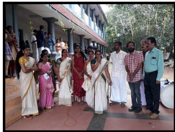
Onam Kit Distribution 2019