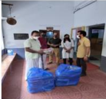
Donating to Palliative Unit