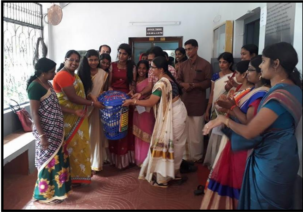
Essential goods distribution for Palliative Patients