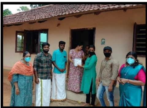
Donating Nebulizer to the Cancer Patient