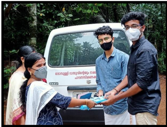
Donating medical kit to heart patient