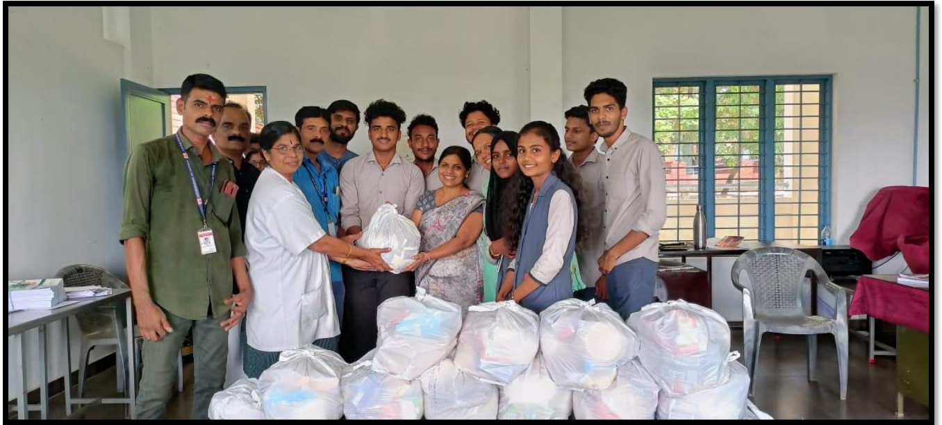
Onam Kit Distribution 2023

The NSS (National Service Scheme) units of Sreekrishnapuram V T Bhattathiripad College organized a thoughtful initiative of distributing Onam kits containing essential items to support the less privileged during the festive season of Onam. The event successfully took place, benefiting a total of 15 needy individuals and families.