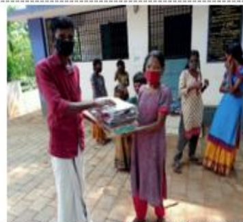
Figure 3 Donating to Palamada Tribal Colony