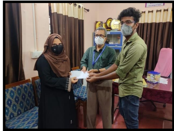
Donating fund to Heart Patient

This programme is for helping heart patients