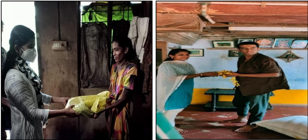
Donating dresses to a differently abled person

There is a Buds School in our locality for Differently Aabled children. We have conducted Cultural Activities for that children. This school has 34 children. We arranged a Butterfly Park in the Buds school that helps to enhance their mental health. We make a documentary and medical camp in association with Kadambazhippuram Govt. Hospital. During the COVID period also we have visited the children's home and give them sufficient support.