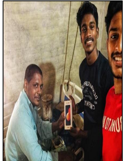
Donating mobile phone to Appu