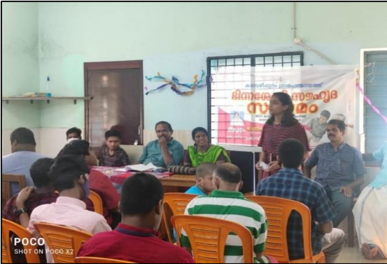
Binna Sheshi Souhruda Sangamam