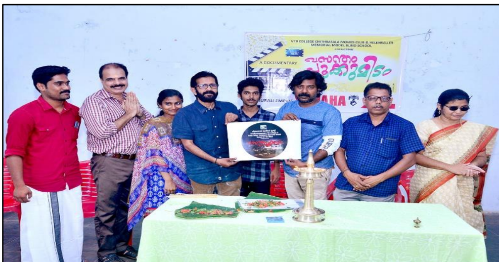
Launching of documentary

VTB College Chitrashala Movies Club and Helen Keller Centenary Memorial School for the Blind jointly produced the logo release of the documentary 'Vasantham Pookumidam'