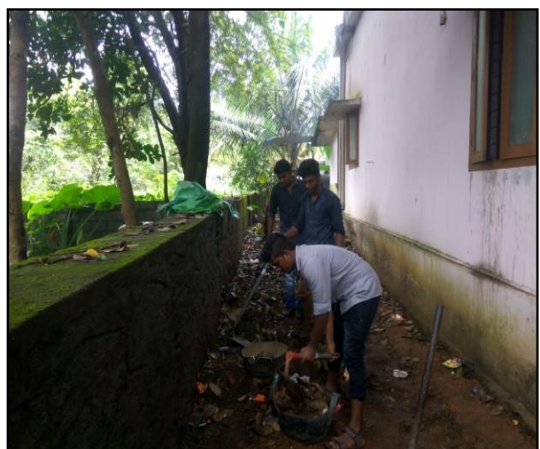
Volunteers cleaning the working council for Visually handicapped