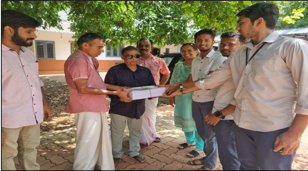
Volunteers collecting books

The National Service Scheme (NSS) organized a significant book sale event, showcasing books crafted by individuals from the Blind Society. The primary objective of this initiative was to empower and support the visually impaired community by providing them with a platform to create and sell their notebooks.