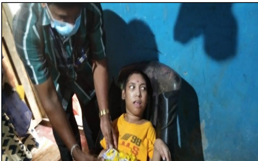
Giving Vishu Kaineettam to Buds School Children