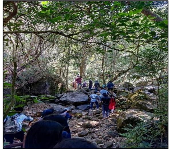
Cleaning at National Park