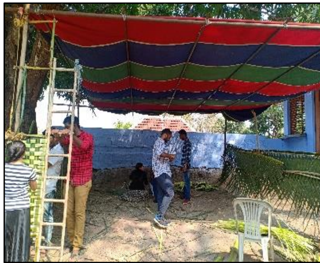
Construction of Stalls by the Volunteers