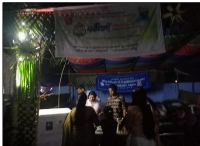
Stall during night