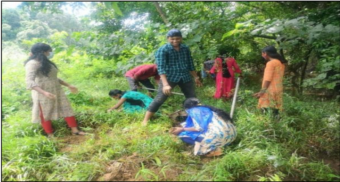
Setting guard for the saplings with waste cloths