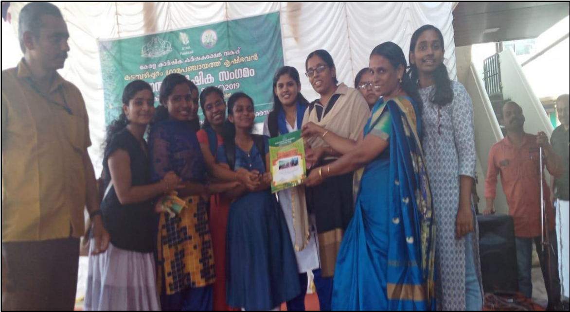
Receiving recognition from Kerala Agricultural Department for valuable contributions