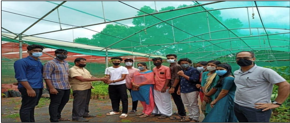
Collecting Bamboo saplings from Forest Department Nursery, Muttikulangara