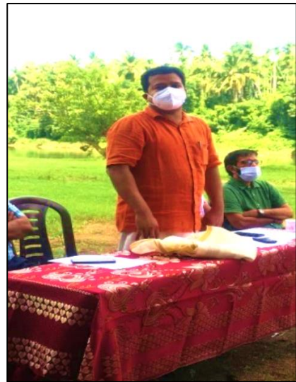
Inauguration by Ottappalam MLA, Adv. K Premkumar