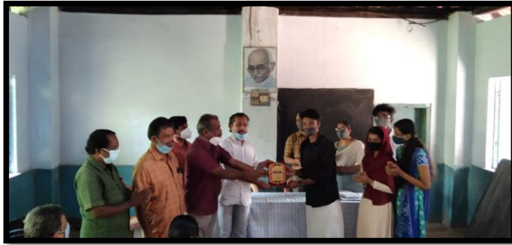
Receiving appreciation from Kadambazhippuram HSS for the contribution