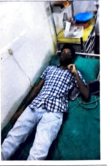
Principal Sreekrishnapuram V.T. Bhattathiripad College P.O. Mannampatta, Palakkad